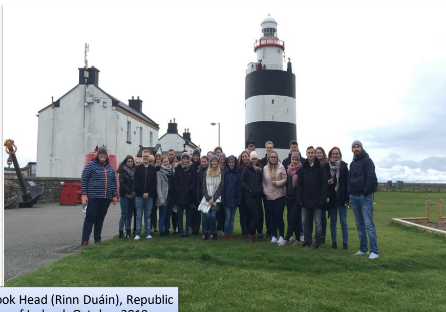
Hook Head (Rinn Duáin), Republic of Ireland, October 2019

We send groups of students to work as interns in Irish companies for a fortnight every year.